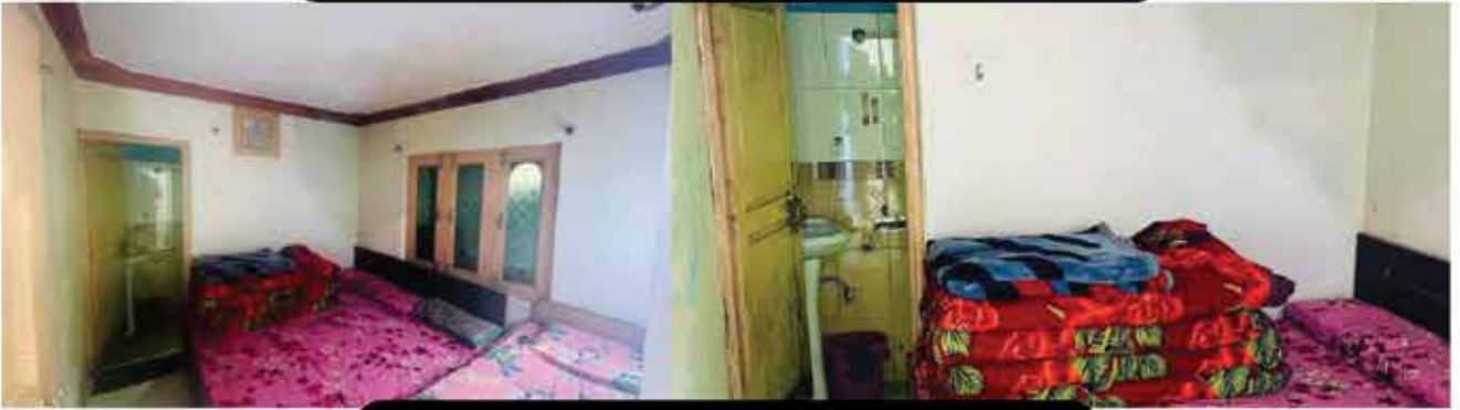
↓ Shree Narayan Resort / Similar ↓