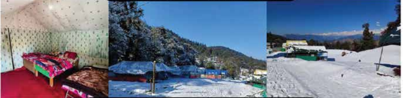
↓ Aarogya Residency Rishikesh / Similar ↓