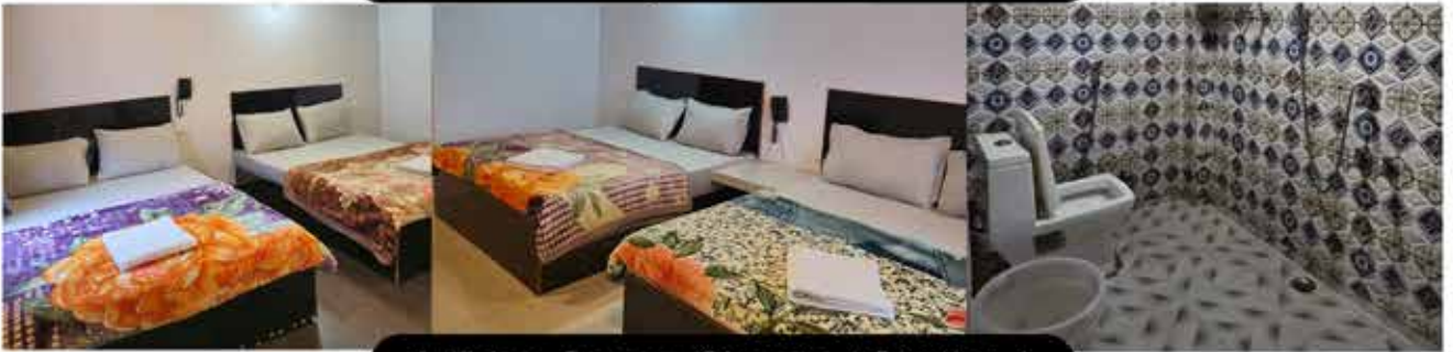
↓ Eden Camps Chopta / Similar ↓